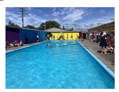
PB4L Celebrations Our PB4L focus this term is Being Responsible.