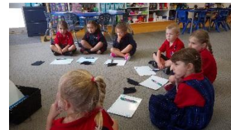
Ready to learn in Teotio.

have Learning Conferences in Term 1 Week 8 (Tuesday 21 st March and Thursday 23 rd March) and then again in Term 3.