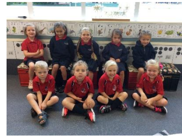
Our newest friends at Southbrook!