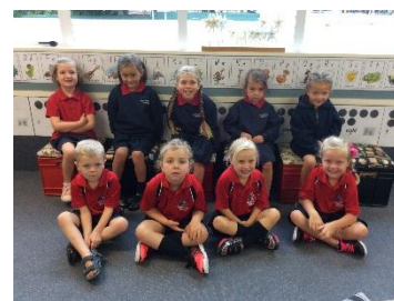
Our newest friends at Southbrook!